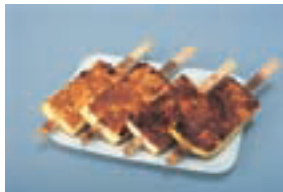
Tofu Dengaku (baked bean curd daubed with miso) Dengaku Jaya TEL019-688-4409