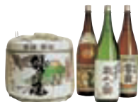
Local Sake - Washino-o TEL0195-76-3211